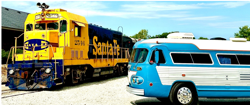
Bus and Train