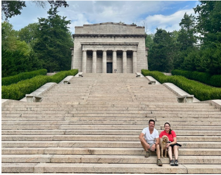
Abe Lincoln Monument