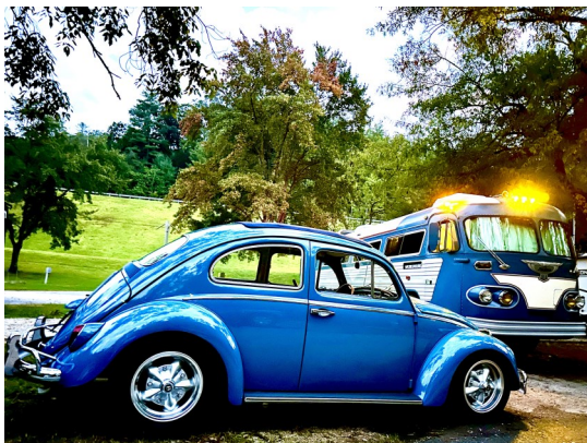
Natural Bridge campsite