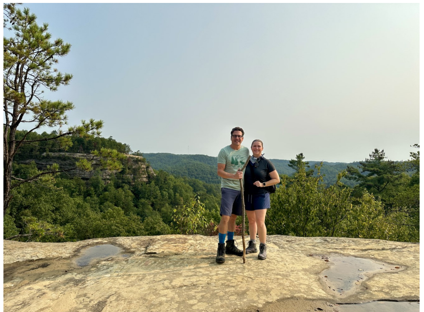
Hiking at Natural Bridge